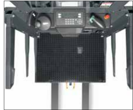
Ergonomic operator compartment